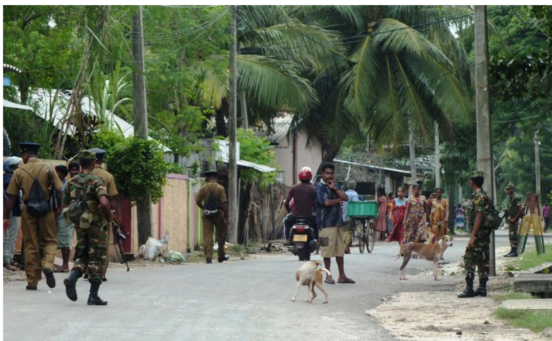
Military deployments increased in Jaffna; Image – Tamil Net

http://tamilnet.com/art.html?catid=13&artid=37507 Last Accessed 29/12/14