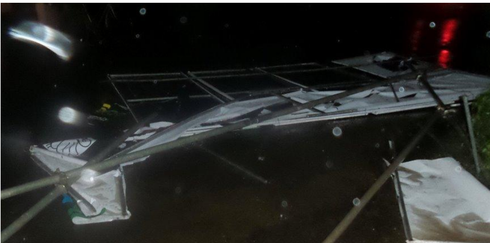
A destroyed opposition political office: The month of November marked the beginning of a series of attacks on political opposition